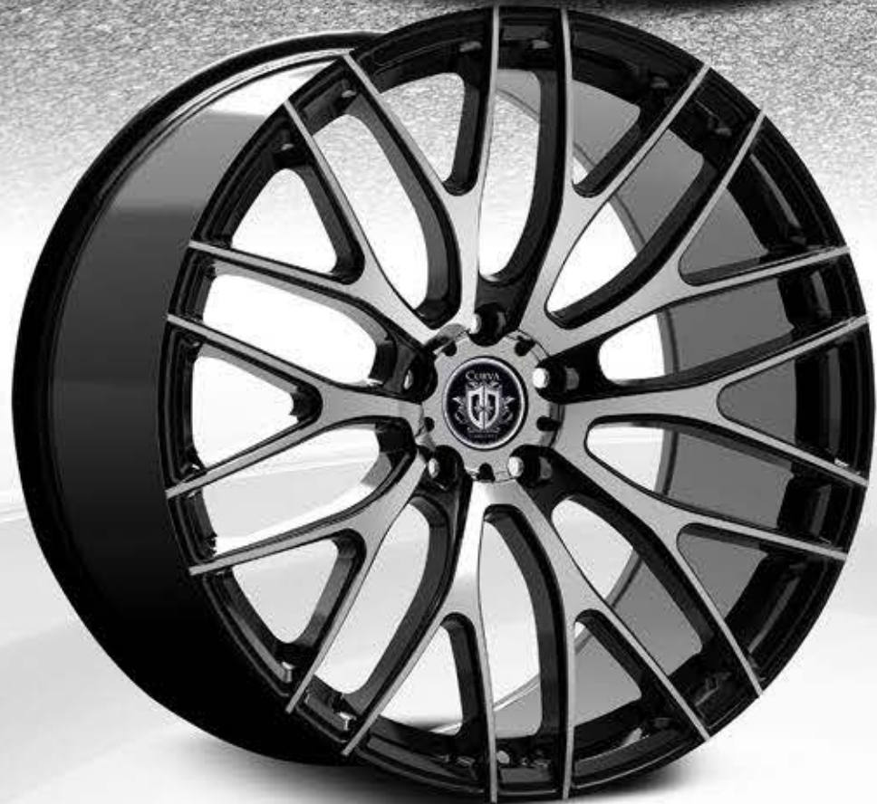
BLACK FINISH WITH MACHINE FACED