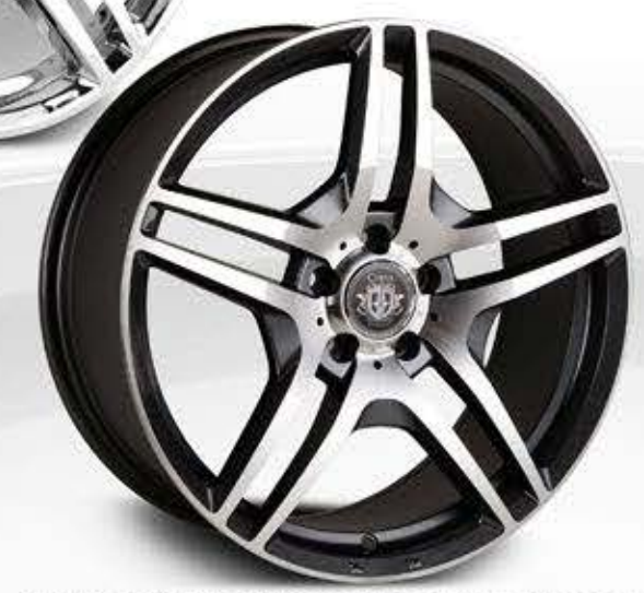
GUN METAL FINISH WITH MACHINE FACE