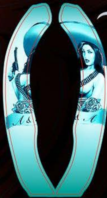
VINYL STICKER WITH ART