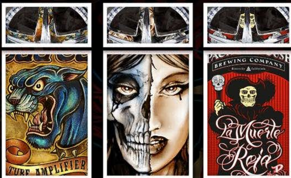
VINYL STICKER WITH ART

CREATING A HOLOGRAM THAT FLOATS OFF THE SPOKES