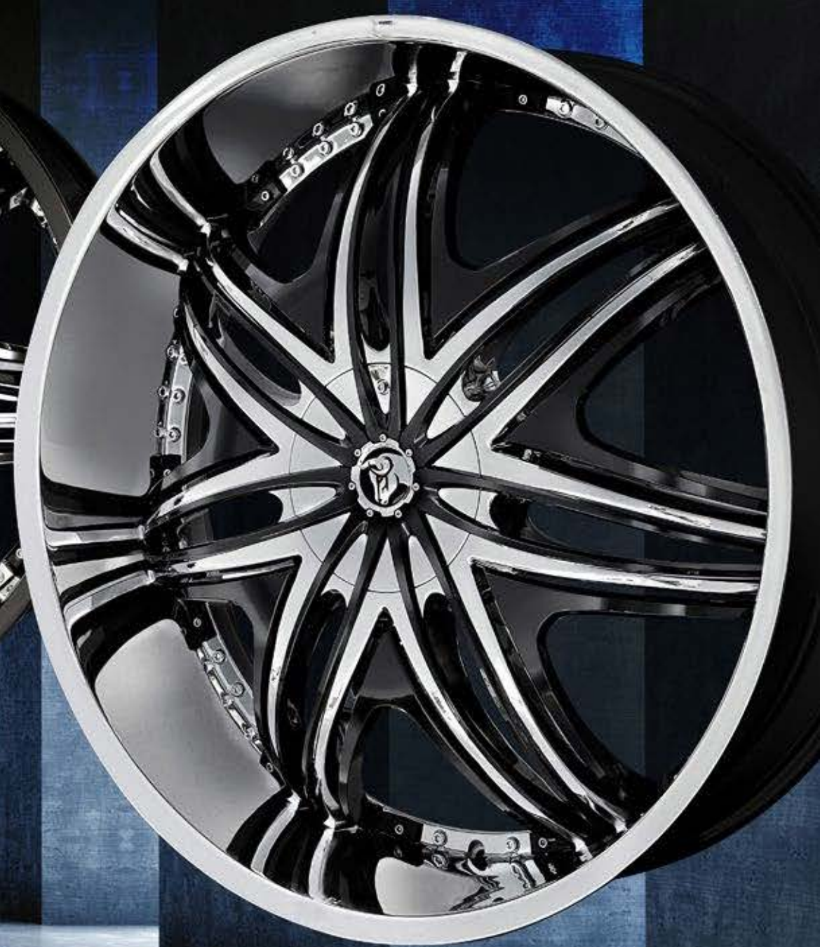
STANDARD THIN INSERTS