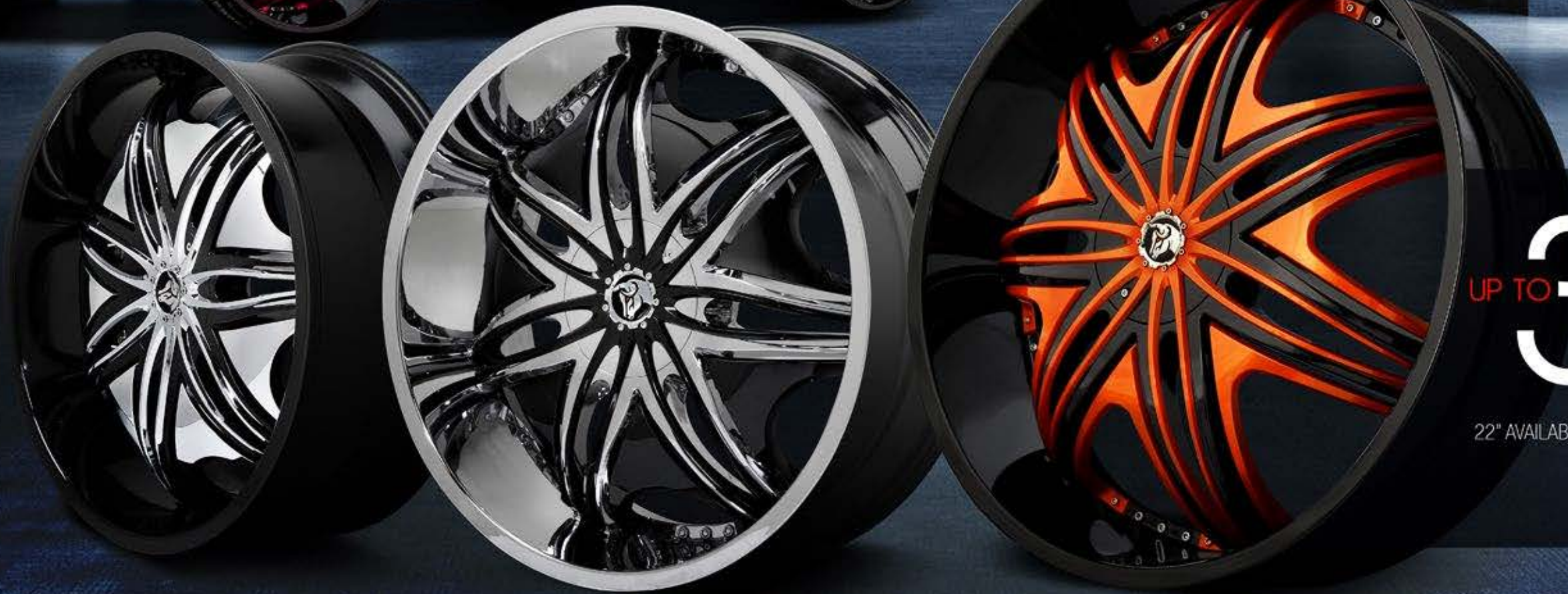
OPTIONAL FULL FACE INSERTS