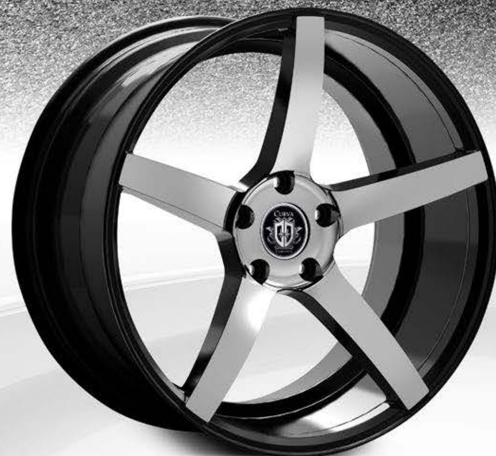
BLACK FINISH WITH MACHINE FACE