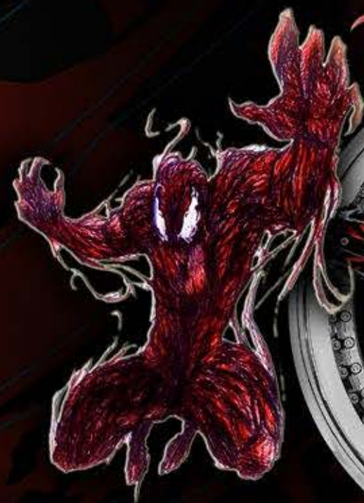
VINYL STICKER WITH ART