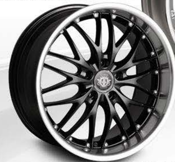
BLACK WITH STAINLESS STEEL CHROME LIP