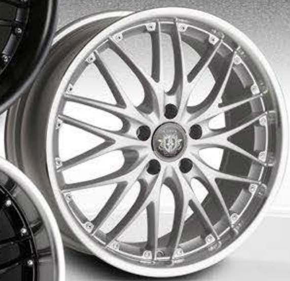
SILVER WITH MACHINE LIP